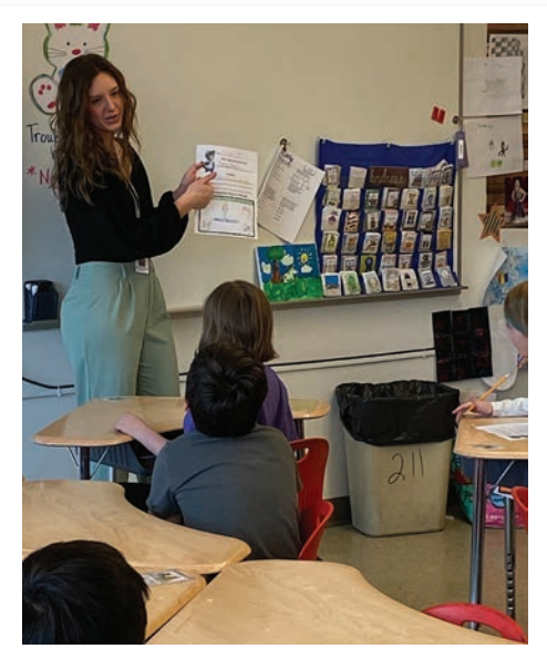
(Counselor's Corner - Continued)

Ohio Means Jobs Readiness Seal. In 2022 we had 26% earn this seal, we were able to boost that to 64% for the graduating class of 2023!